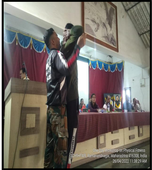
Demonstration of physical exercises