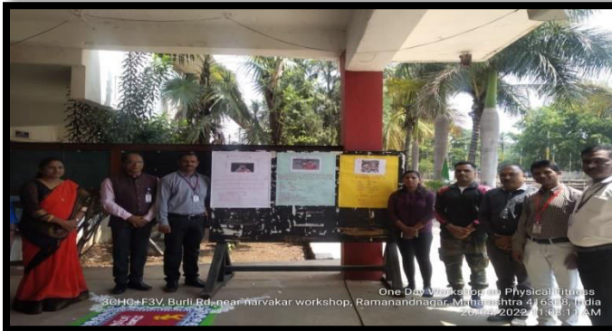
Inauguration of Poster Presentation by the Guest