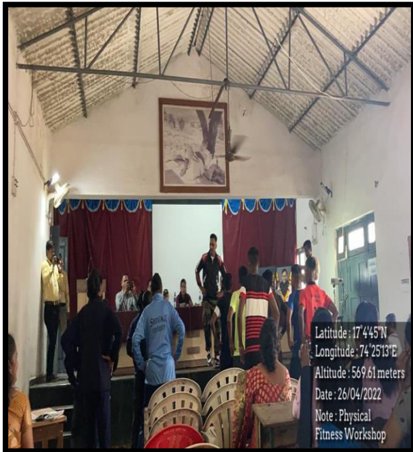
Demonstration of Aerobics Exercises